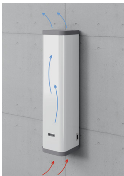
Airflow disinfection function

The design of the luminaire interior ensures perfect air flow and the highest level of disinfection efficiency. The UV-C Sterilon Air luminaire is equipped with protection against opening. Removing the top cover requires a hex key.