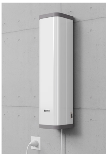
Version with cord (3 m)